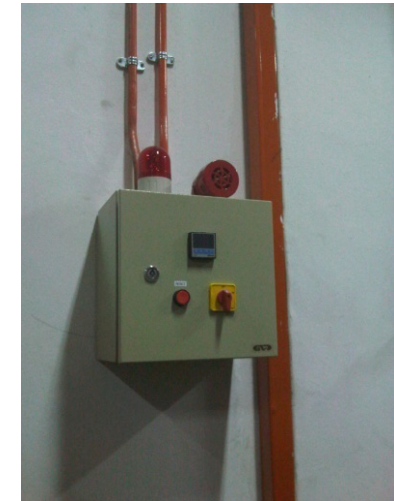
Temperature Monitoring with alarm