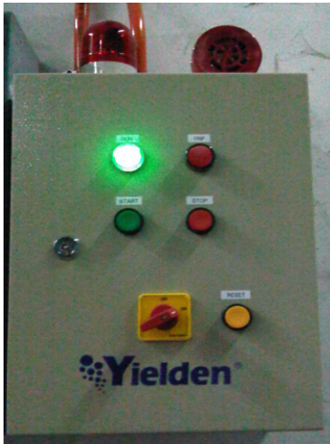
Starter Panel with alarm