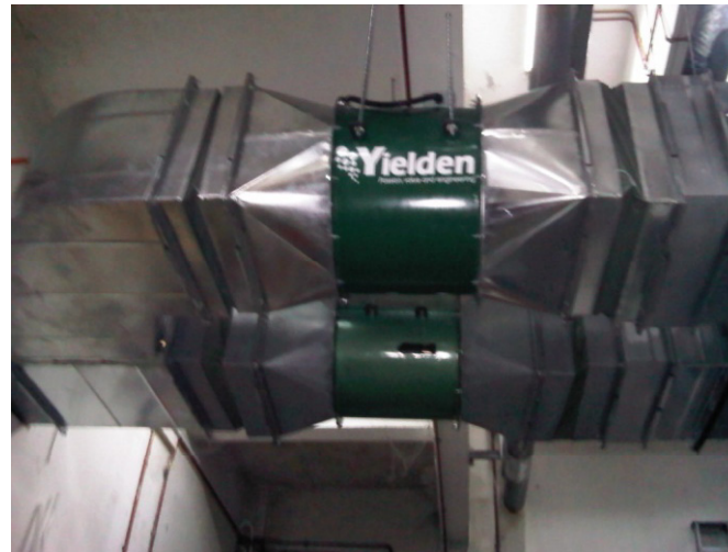
Ventilations fan and ducting works